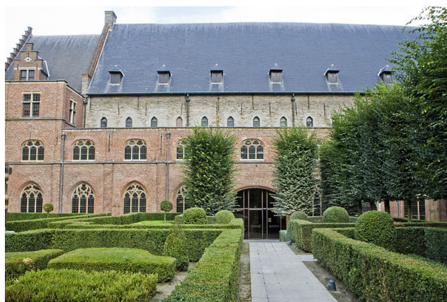
Pieter Morlion, Creative Commons